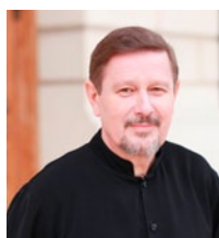
Voicu Popescu Girls Choir